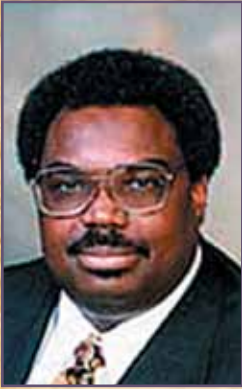
Senator Hank Sanders