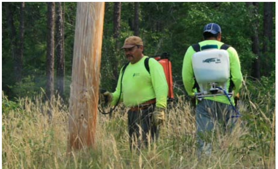
Right-of-way spraying crew work in Deer Park to help control undergrowth.

Undergrowth spraying is a very cost saving measure of controlling right-of-way growth. Several hundred miles of line are being sprayed this summer on our system. We are constantly seeking ways to keep the power system in the very best condition and maintain this status at the most cost saving ways possible.